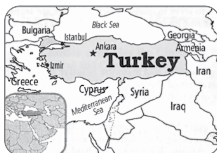
*Primary source: CIA World Factbook

The bookshops attract people from all walks of life who may have a curiosity about Christianity. For example, a man visited the shop in Izmir. He said that he was curious about Christianity but had never find a way to learn about it. He was happy to find a Christian whom he could talk to. Your gift to Bible a Month Regular Giving this month will help to support Bible hubs in Turkey.