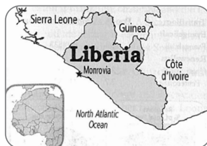
*Primary source: CIA World Factbook

The Bible Society in Liberia is providing Bibles, New Testaments, and portions to new believers in rural communities, who have completed the Faith Comes By Hearing (FCBH) programme and have developed some literacy skills. The intention is to grow new believers in their faith and help them become established in their churches. Your gift to Bible a Month Regular Giving will help to support this project this month.