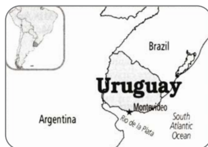
*Primary source: CIA World Factbook

Bible Society often receives feedback from the teachers and pastors of the churches about the needs of these children, particularly those in the interior of the country, and how grateful they are to receive the Scripture books and the chocolate powdered milk food. Your gift to Bible a Month Regular Giving this month will help to support this project.